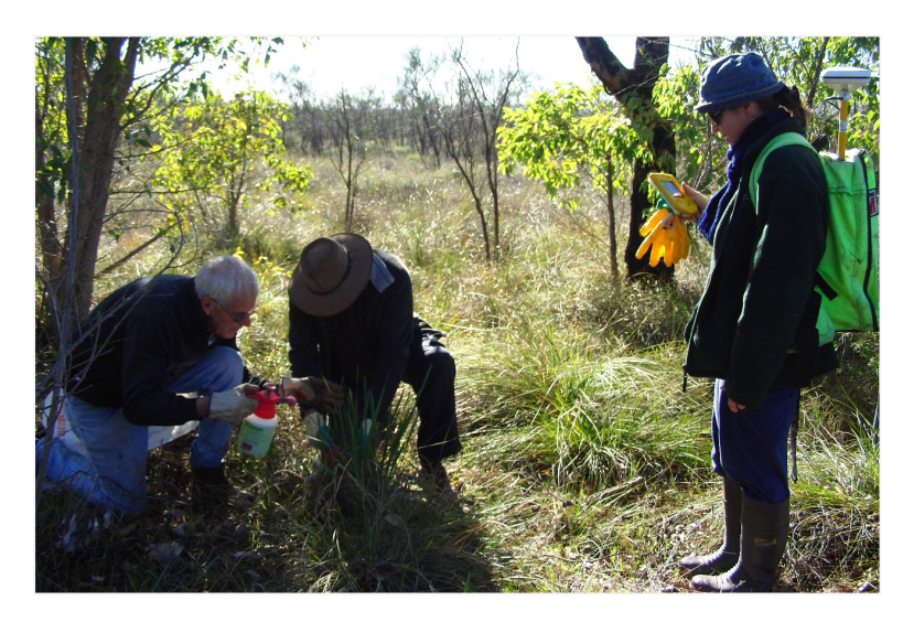
Figure 10: Volunteers killing invasive weeds with organic pesticide and geotagging its location

Although the group is mainly focused on restoration activities, bushfires (natural or human lit) remain one of the prominent challenges for the group. Since the BSW is a seasonal wetland, areas that are inundated in the winter (Figure 5) dry out completely during the hot summer, which increases fire risk. There have been two major incidents in a past decade (Figure 9) alone, despite collaboration with state agencies in implementing bushfire risk reduction measures. The group is heavily dependent on community members living adjacent to the wetlands to contact the local fire brigade during an emergency.