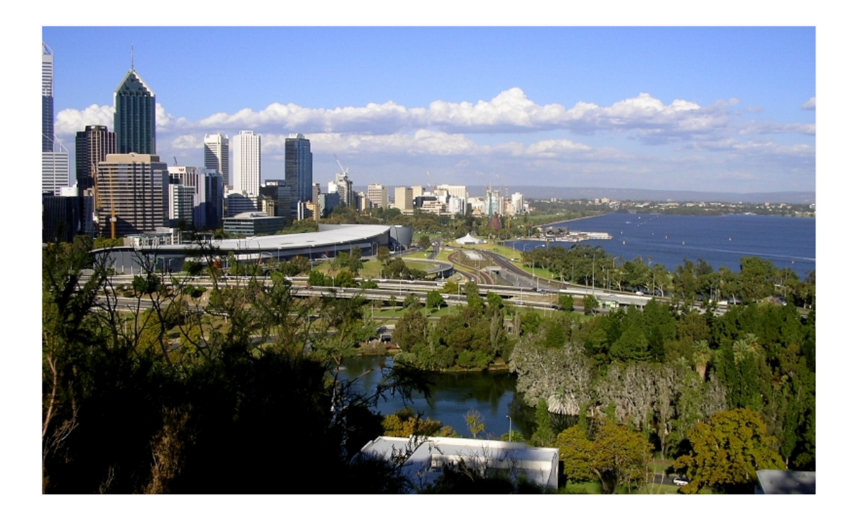
Figure 2: Perth skyline as seen from the Kings Park