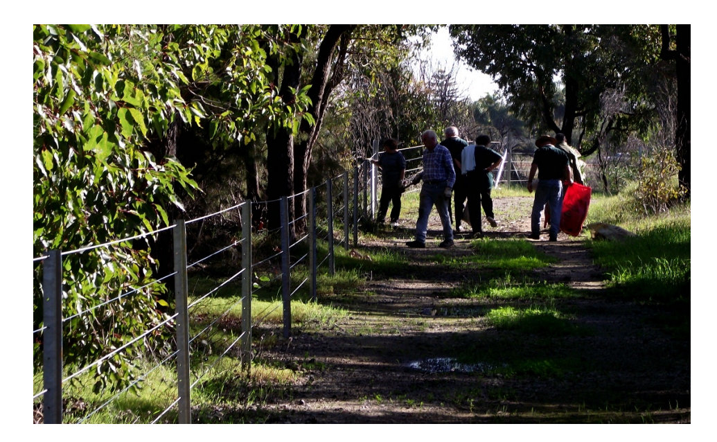
Figure 13: New fence in the southwest corner of the BSW

It is clear that the group has been able to acquire, maintain and utilise various forms of resources effectively for nearly a quarter of a century. In doing so, the group has developed the adaptive capacity required to become a successful advocate of sustainability, and preserve the BSW (Figure 14) for current and future generations.