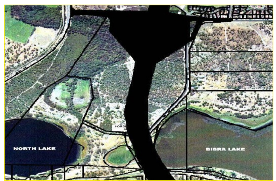
Figure 3: Proposed highway development between the two lakes [URL: <u>http://www.savenorthlake.com.au]</u>