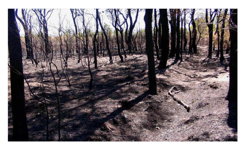
Figure 9: The aftermath of the 2009 bushfire

Although the group is mainly focused on restoration activities, bushfires (natural or human lit) remain one of the prominent challenges for the group. Since the BSW is a seasonal wetland, areas that are inundated in the winter (Figure 5) dry out completely during the hot summer, which increases fire risk. There have been two major incidents in a past decade (Figure 9) alone, despite collaboration with state agencies in implementing bushfire risk reduction measures. The group is heavily dependent on community members living adjacent to the wetlands to contact the local fire brigade during an emergency.