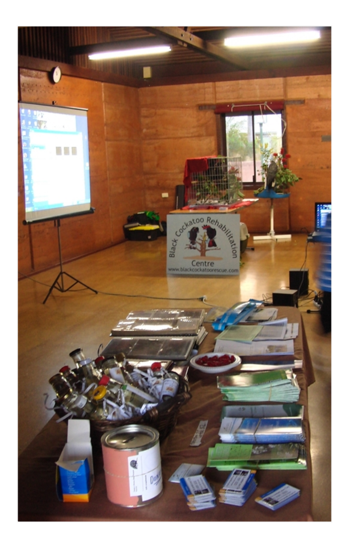
Figure 11: Community event held in the local library

The group has tried hard to maintain strong relationships with key stakeholders in relation to funding opportunities. It has received grants from a wide variety of sources in the past two decades, including local, state, and federal governments. Non-governmental organisations and educational institutions have also continuously supported the group. Regional environmental networks have been instrumental in helping the group to apply for grants, host a webpage, and organise community events. These events (Figure 11) provide unique opportunities for the group to promote its cause and collect donations by selling informative materials like calendars and greeting cards. However, funding shortages have consistently hindered or delayed many large-scale projects.