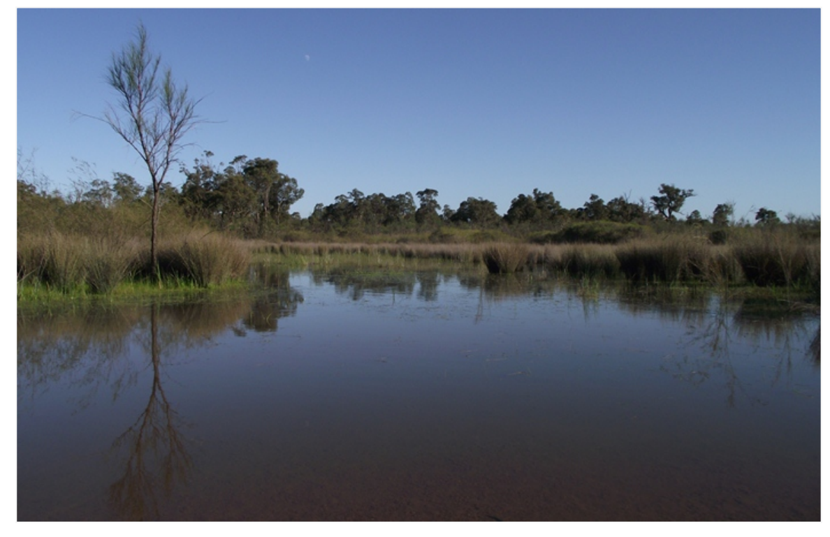
Figure 5: Brixton Street Wetlands in winter

The BSW (Figure 5) is spread over 0.19 square kilometres and is of outstanding botanical significance. As a seasonal wetland, BSW has higher species richness compared to permanent wetlands in Perth. It is home to more than 300 species of plants—equivalent to more than 20% of Perth's flora in only 0.005% of its total area (Phillimore, 2003).