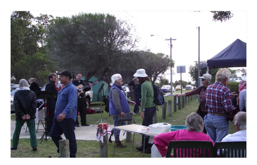
Figure 6: Celebrating sustainability activism: Brixton style

The persistent activism of the group—enabled by the ability of its leaders to harness connections within the local community and with other SAGs persuaded the government agency to recognise the BSW as one of the nationally significant ecosystems in Perth. This achievement is often celebrated with annual community events (Figure 6) where wetlands enthusiasts from all walks of life come together to learn about the wetlands and exchange ideas and information.