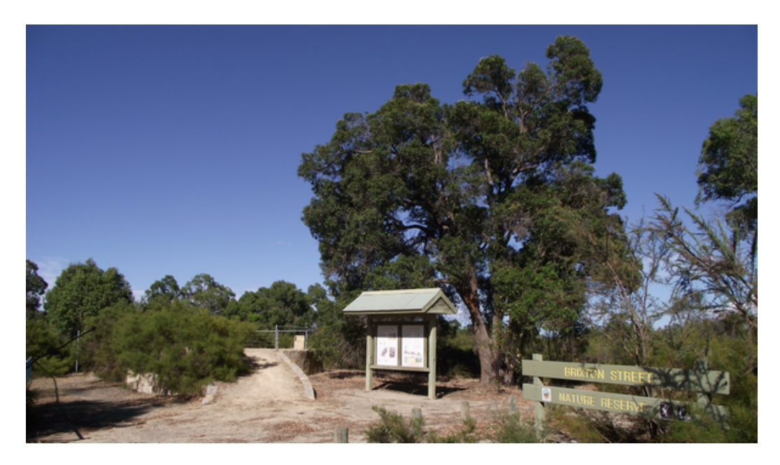
Figure 14: Signpost, information hut & a lookout as seen from the main entrance

It is clear that the group has been able to acquire, maintain and utilise various forms of resources effectively for nearly a quarter of a century. In doing so, the group has developed the adaptive capacity required to become a successful advocate of sustainability, and preserve the BSW (Figure 14) for current and future generations.