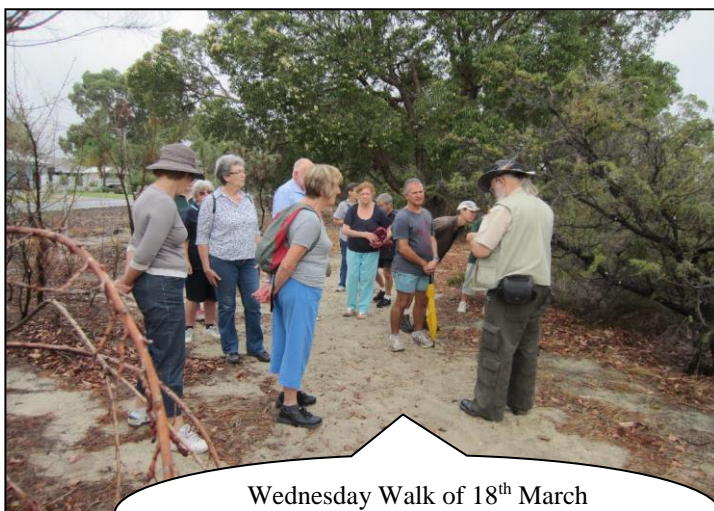
Wednesday Walk of 18 th March