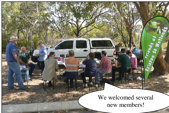
We welcomed several new members!