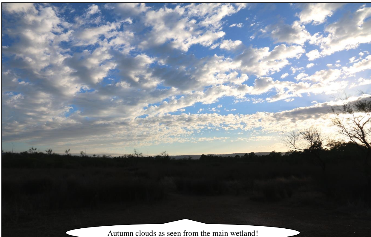
Autumn clouds as seen from the main wetland!