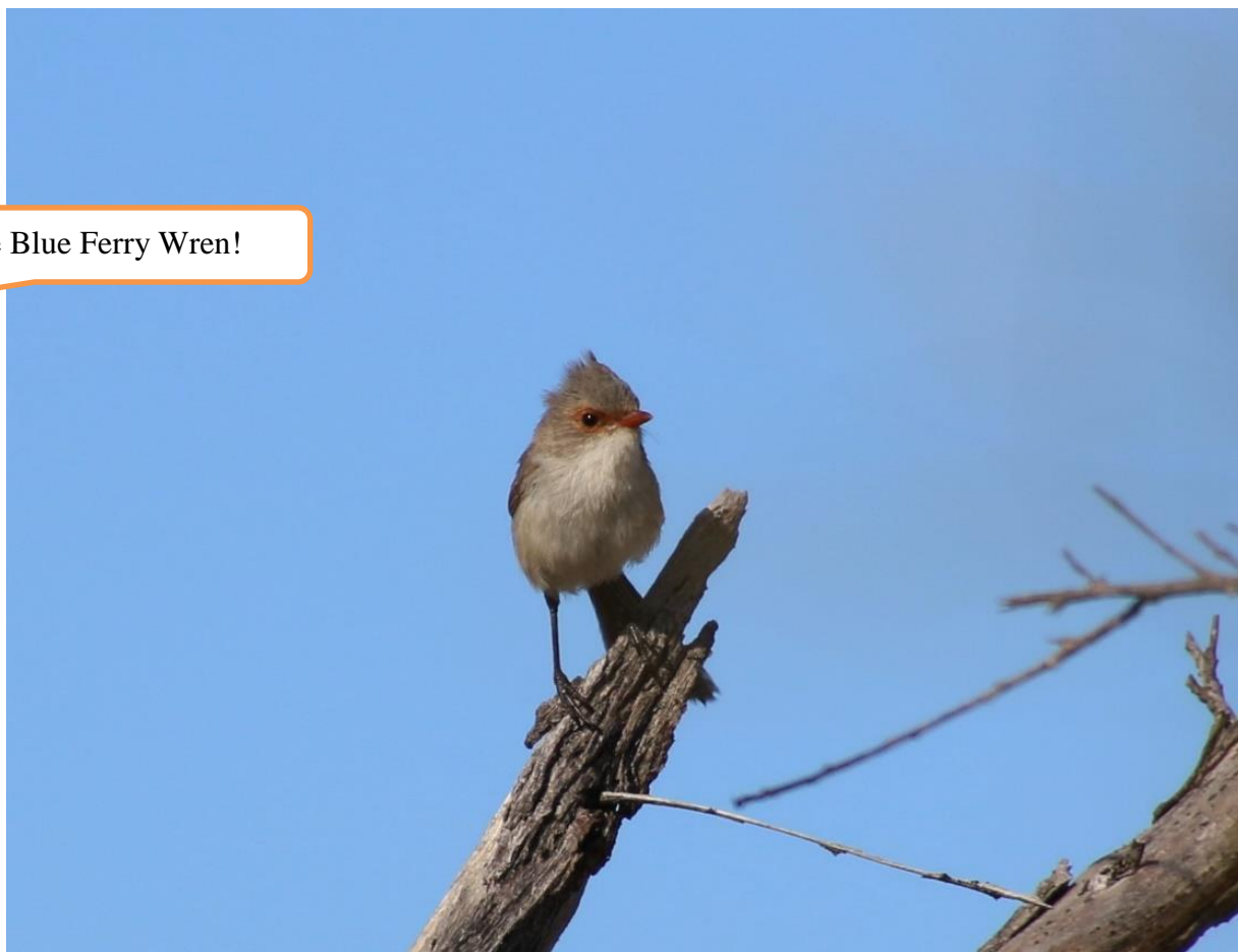
Female Blue Ferry Wren!