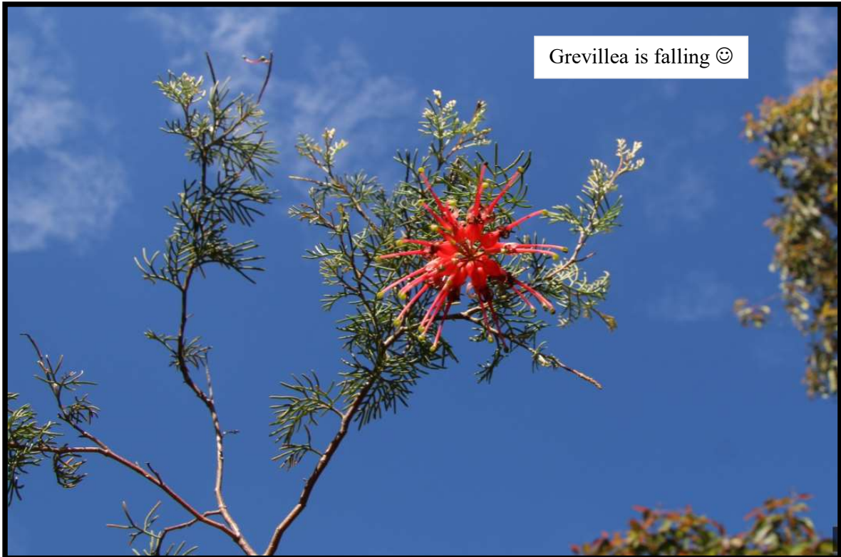
Grevillea is falling 😊