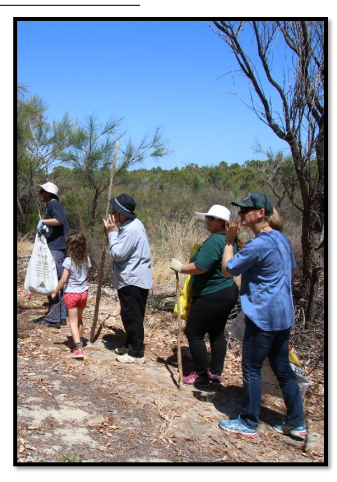
Oy oy, have you seen a naked Gerbera? ©