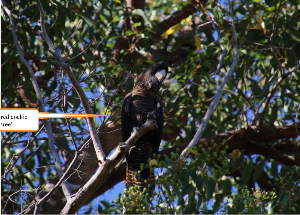
A juvenile red cockie on a Marri tree!