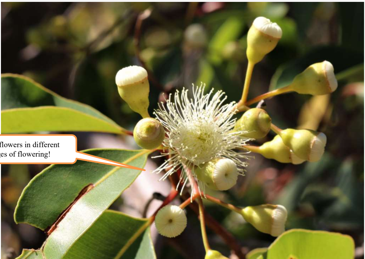
Marri flowers in different stages of flowering!