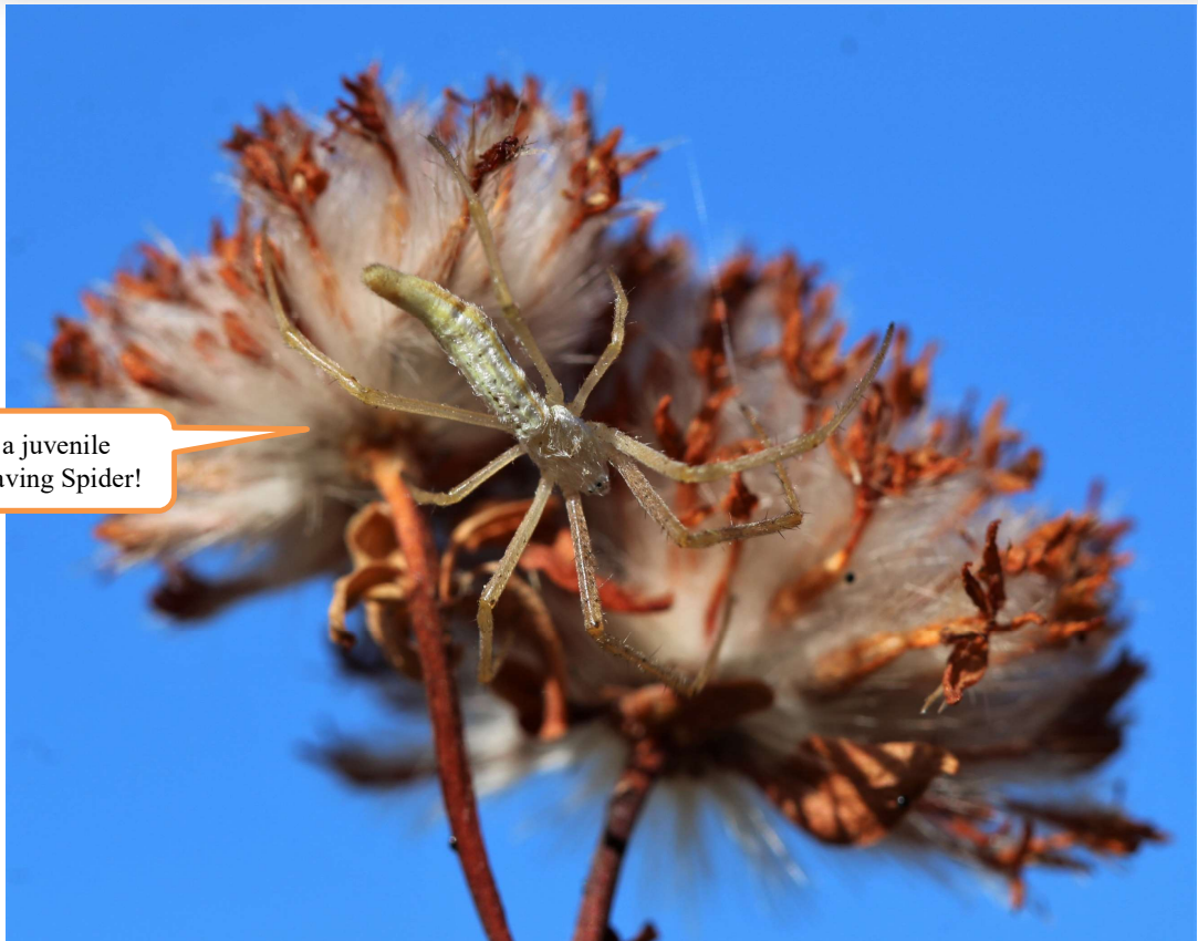
It looks like a juvenile Silver Orb Weaving Spider!