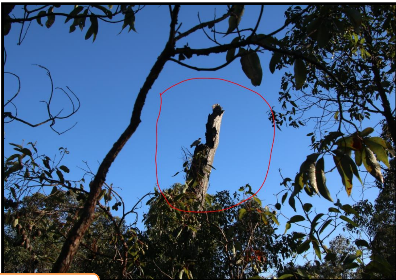
An Australian Wood Duck on a dead wood 😊